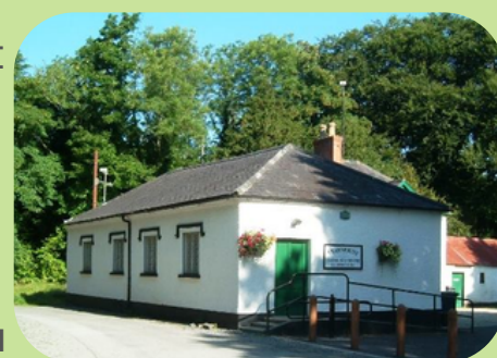
Learmount Community Development Group